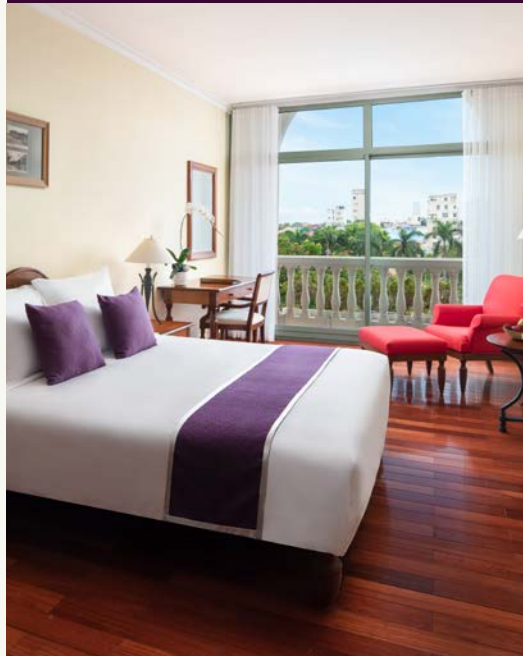
Executive Room 30 sqm