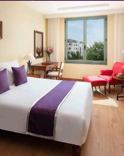
Deluxe Room 30 sqm