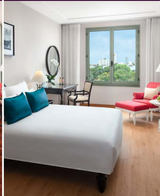
Club Executive Room 30 sqm