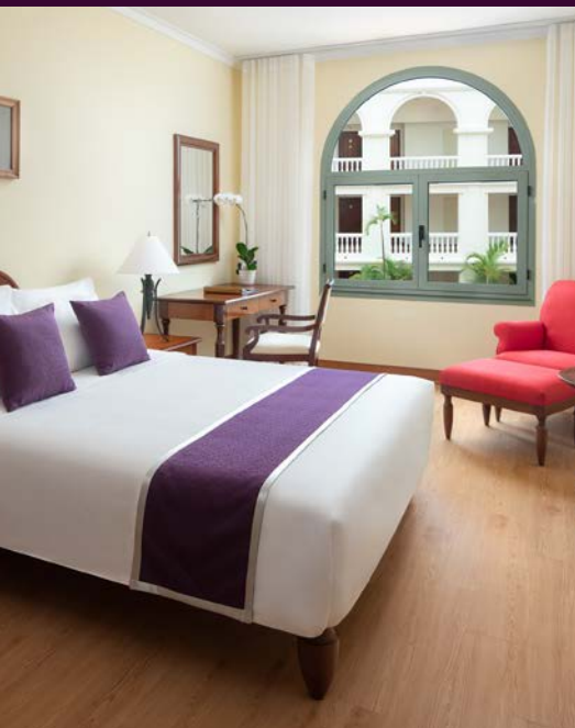
One Bedroom Apartment 60 sqm