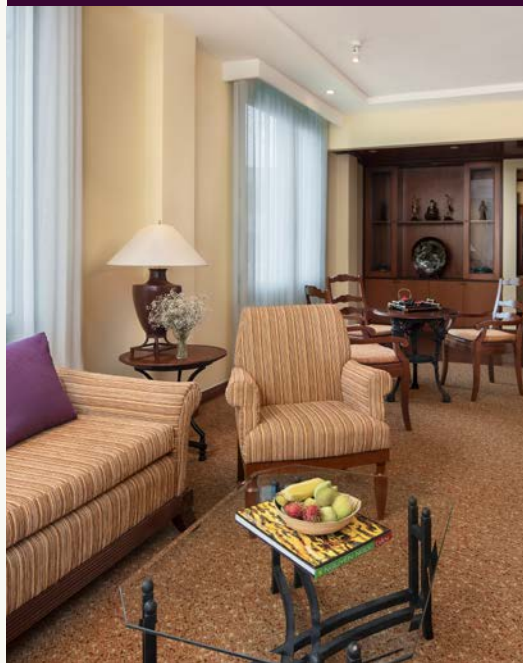
Suite/ Suite Apartment 75 - 90 sqm